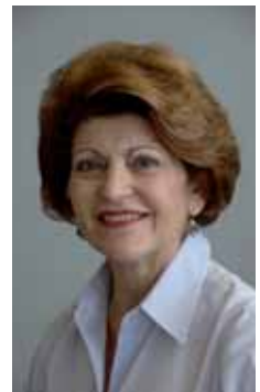
Androulla Vassiliou European Commissioner Responsible for Sport

I would like to thank the project leaders and their 357 partners, who have contributed to the success of these Preparatory Actions. I also wish to express my gratitude to the 405 applicants whose projects could not be selected. They demonstrated that there is a real demand in European society for this type of EU intervention, thus contributing to our proposal for the Sport Chapter of the future Programme.